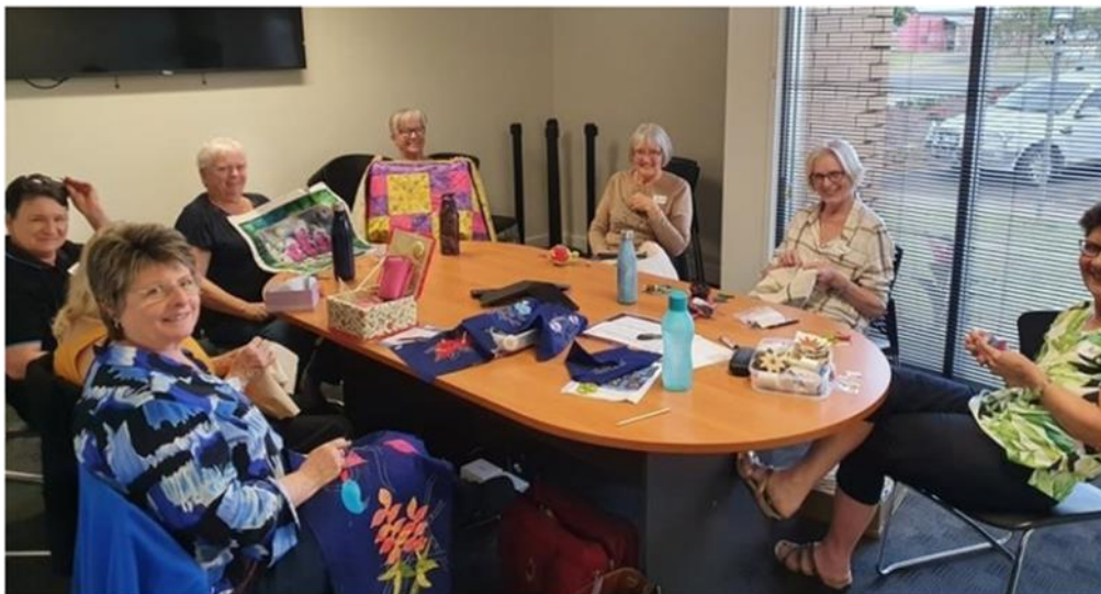
Stitch and Chat