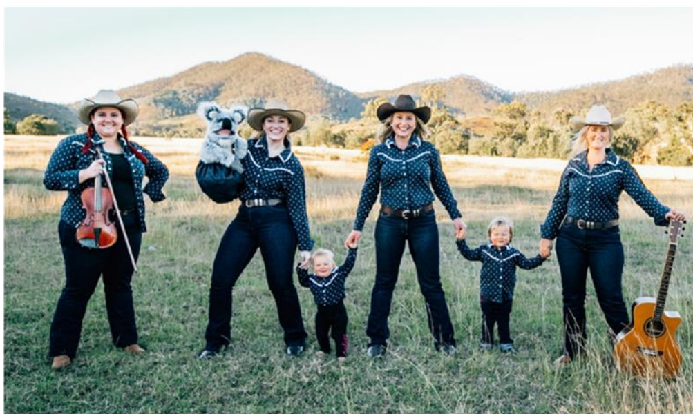
Blue Gum Farm